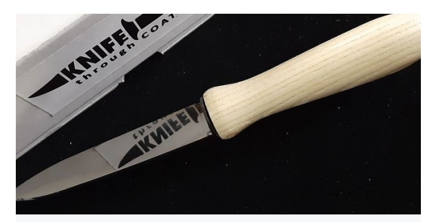
KNIFE THRU COAT $90

Mnemodexterity $12 - is L. De Bevere's work on the Memorized Deck. If you've never utilized a Memorized Deck, let us say that it's quite an amazing piece of a card worker's arsenal. Once you've mastered it, the effects seem absolutely impossible and amazing to your audience. This very hard-to-find manuscript contains some of De Bevere's best work. This manuscript also includes his work with alphabet cards.