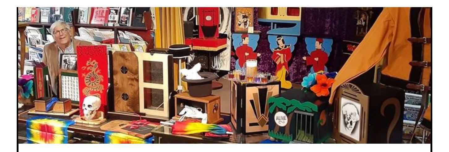
Get Together Price goes up to $325 on April 15th (4 days from now) - Get your registration early and save!